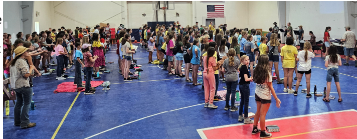
The group of 11 & 12 year olds I got to speak to at Cocolalla Lake Bible Camp

This summer I had the honor of speaking at both Cocolalla Lake Bible Camp and Shiloh Bible Camp, as well as helping out for a week at Fir Point Bible Camp. Even though I am not in camp ministry full time anymore, I still love it and am excited to be able to be a part of it. It is a thrill to be able to support the missionaries we care for in what they do. Camps are only one example of that, but I believe it is one of the most effective when it comes to sharing the Gospel.