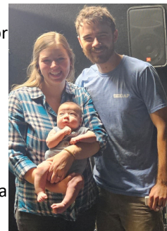
The Creightons do kids camps & after school clubs